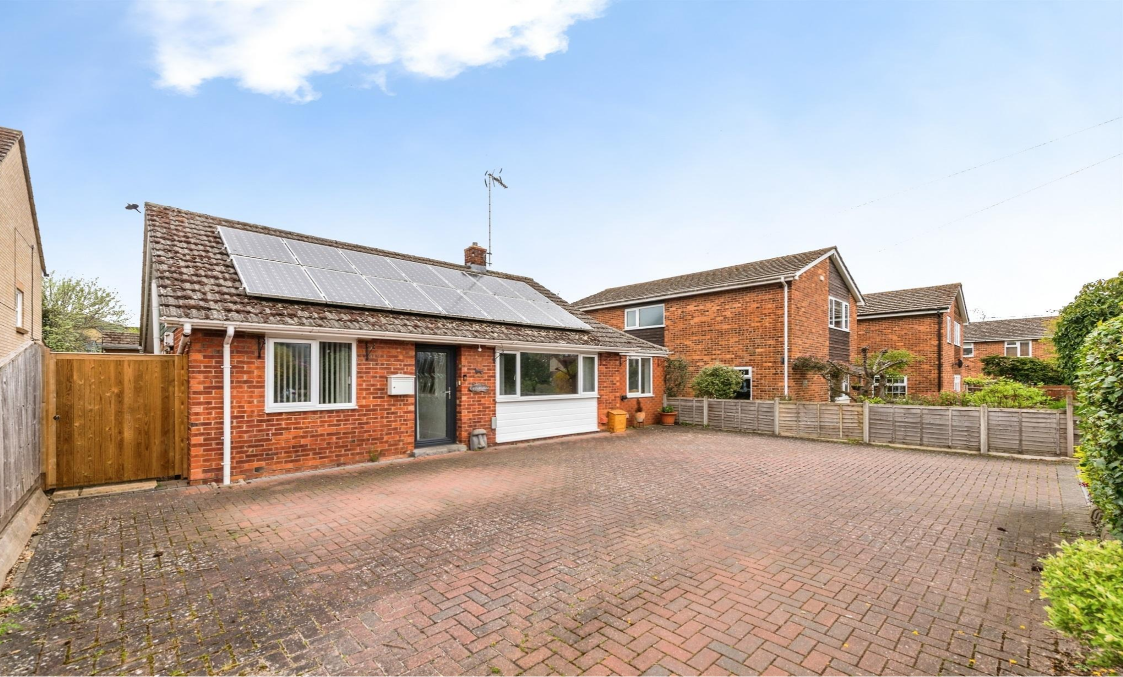
Cedar Glow, Faringdon Road, Kingston Bagpuize, ABINGDON, OX13 5AQ