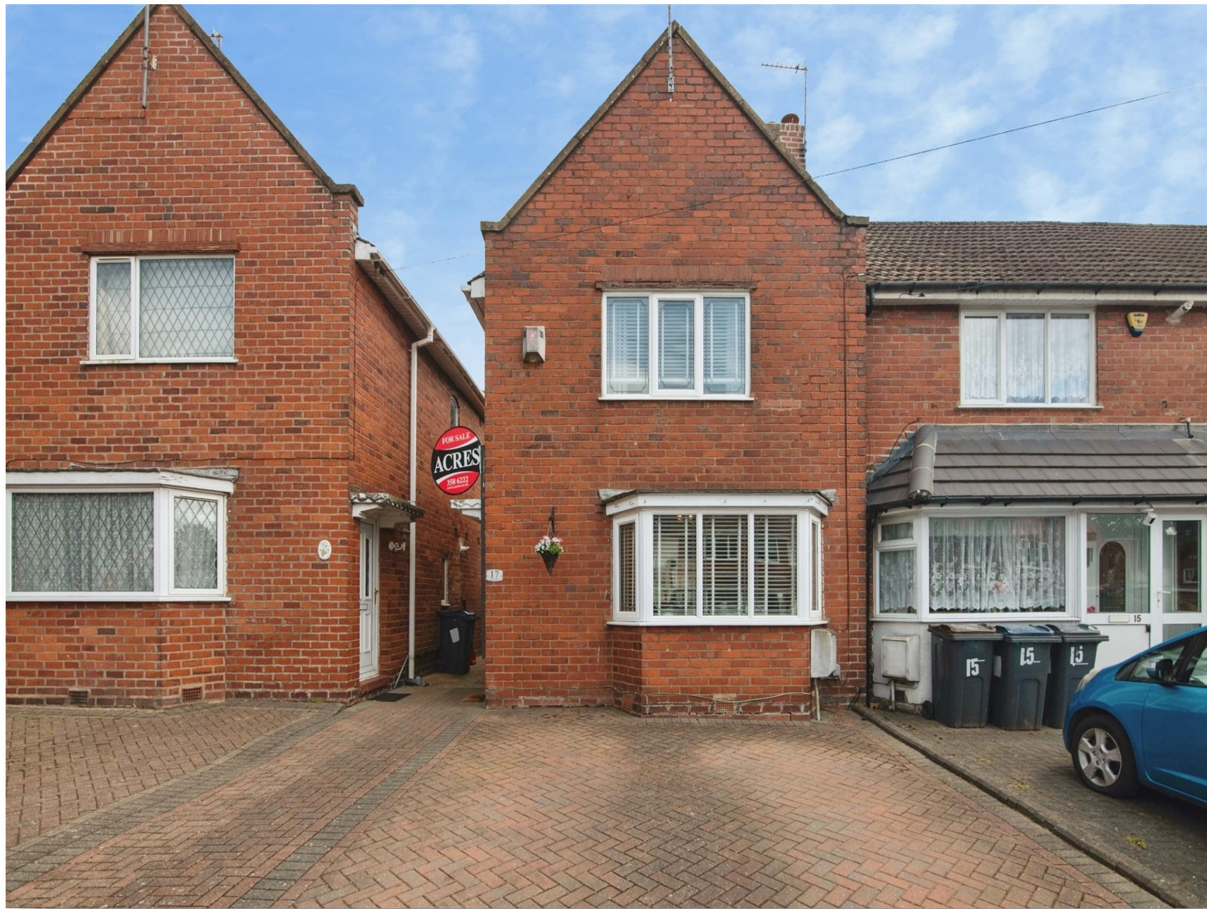
Bradfield Road, Birmingham B42 2RT