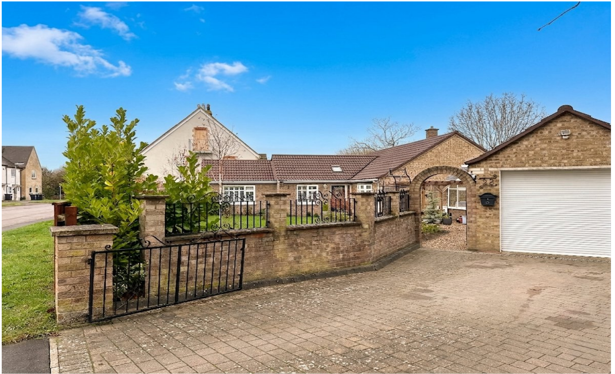
Reach Road Burwell Cambridgeshire