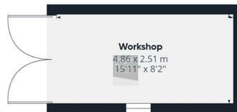
Ground floor Building 2