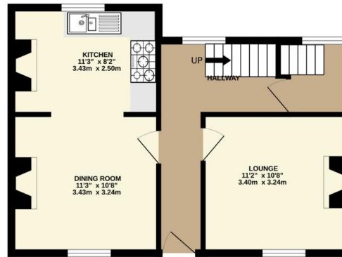
GROUND FLOOR 430 sq.ft. (39.9 sq.m.) approx.