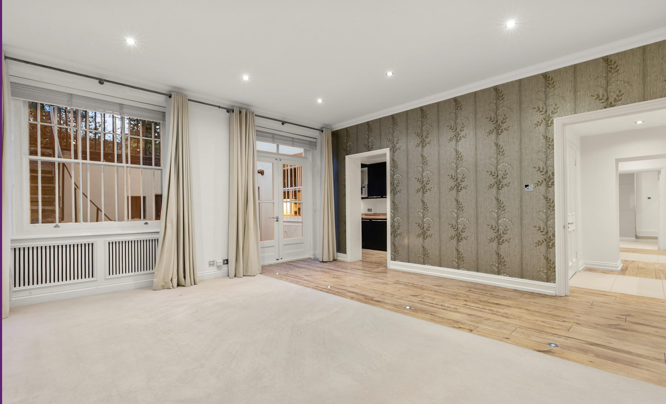
Queens Gate Gardens South Kensington, SW7