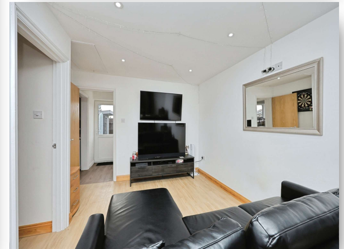
Trinity Close, Dereham, NR19 2EP