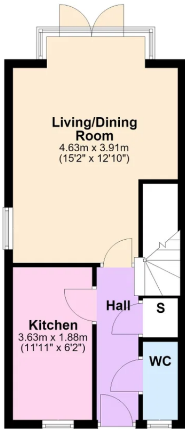
Ground Floor Approx. 33.6 sq. metres (361.4 sq. feet)