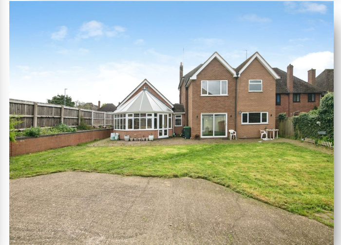
Pear Tree Drive, Birmingham B43 6HS