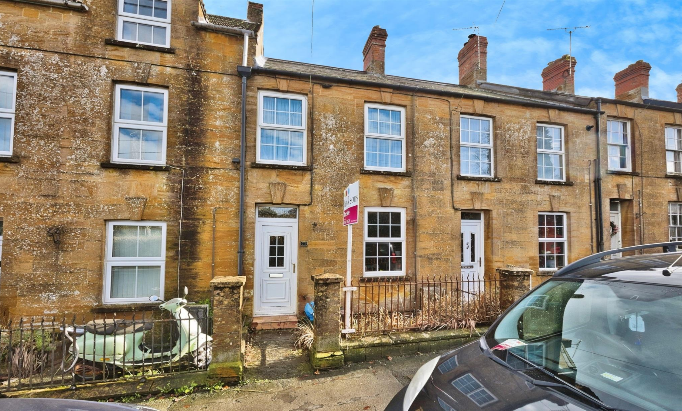
Hermitage Street, Crewkerne TA18 8EX