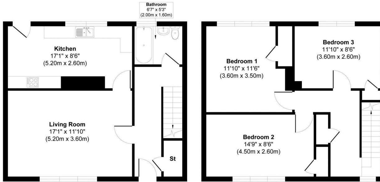
Ground Floor Approximate Floor Area 495 sq. ft (45.99 sq. m)