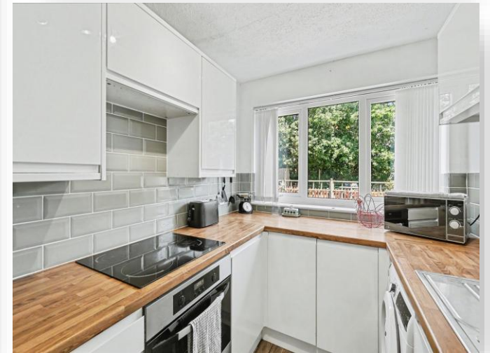
Birkdale Close, Northampton NN2 7PD