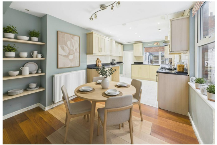
Virtually Staged Kitchen