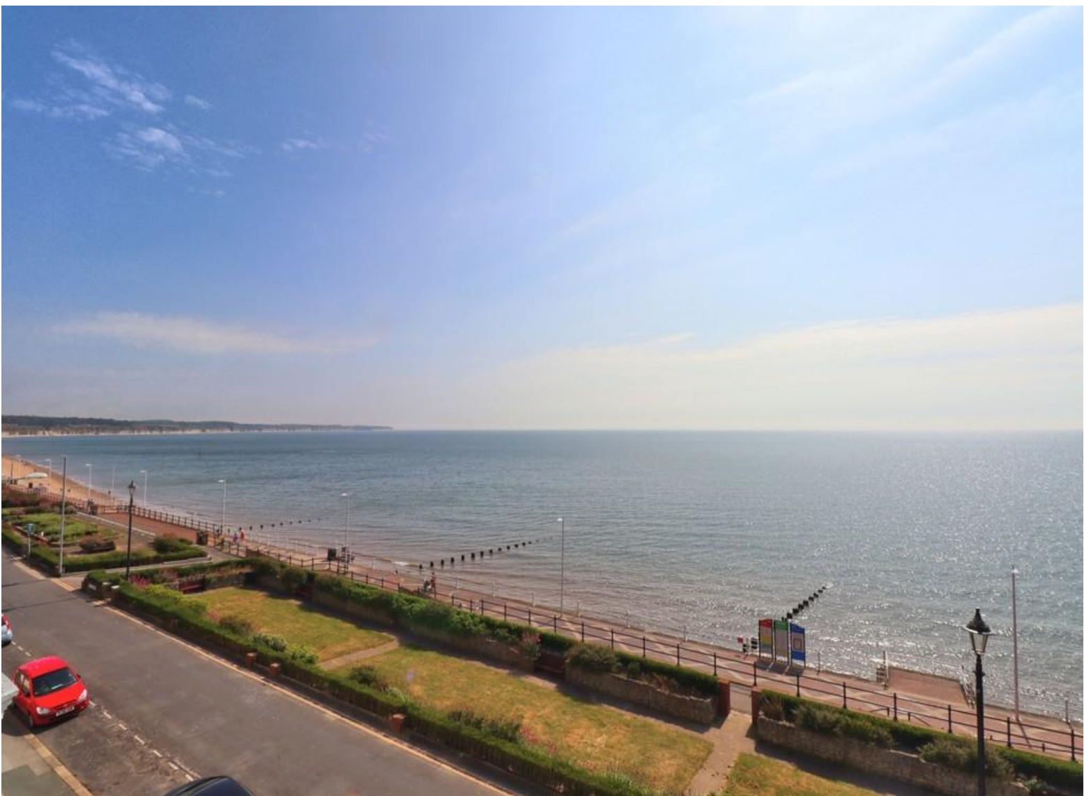
Bridlington South Side