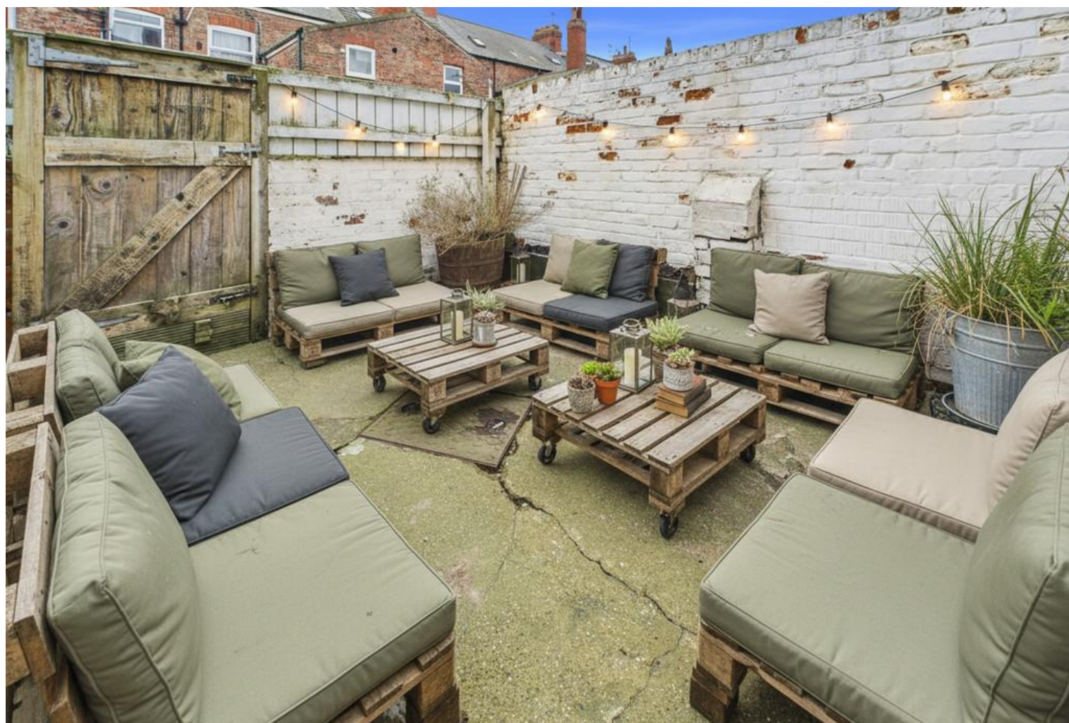
Virtually Staged Rear Yard