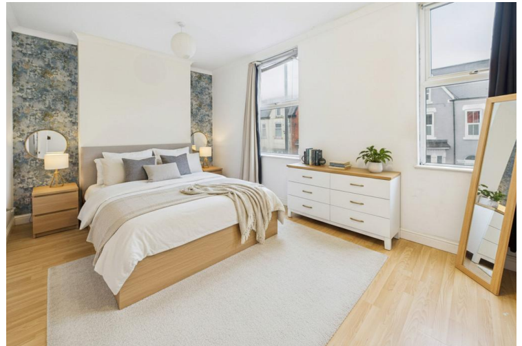
Virtually Staged Bedroom 1