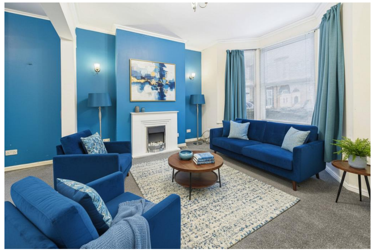
Virtually Staged Lounge