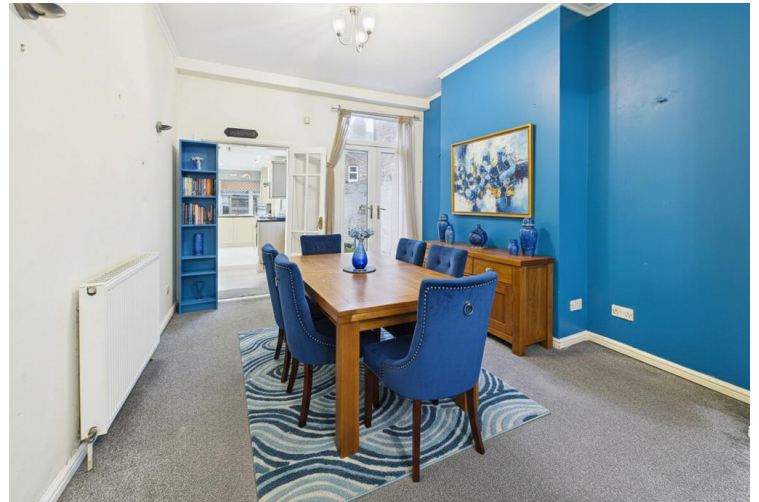
Virtually Staged Dining Room