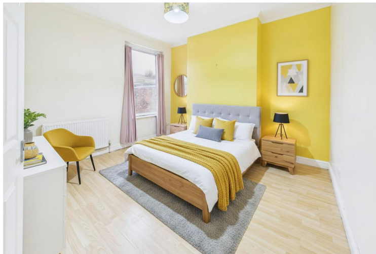
Virtually Staged Bedroom 2