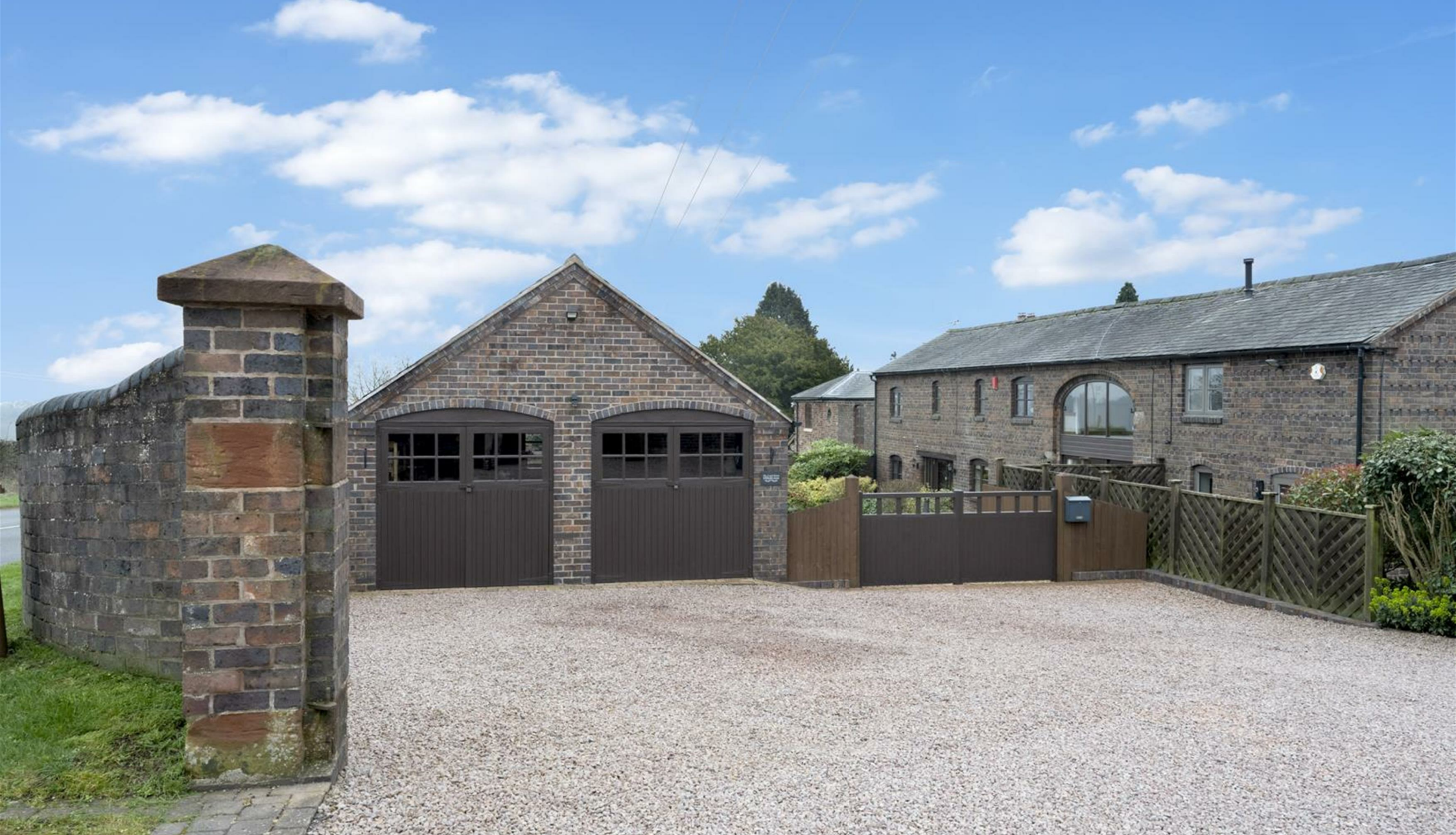
The Coach House, Hillfields Farm, Shatterford Lane, Wolverley, DY11 5TG