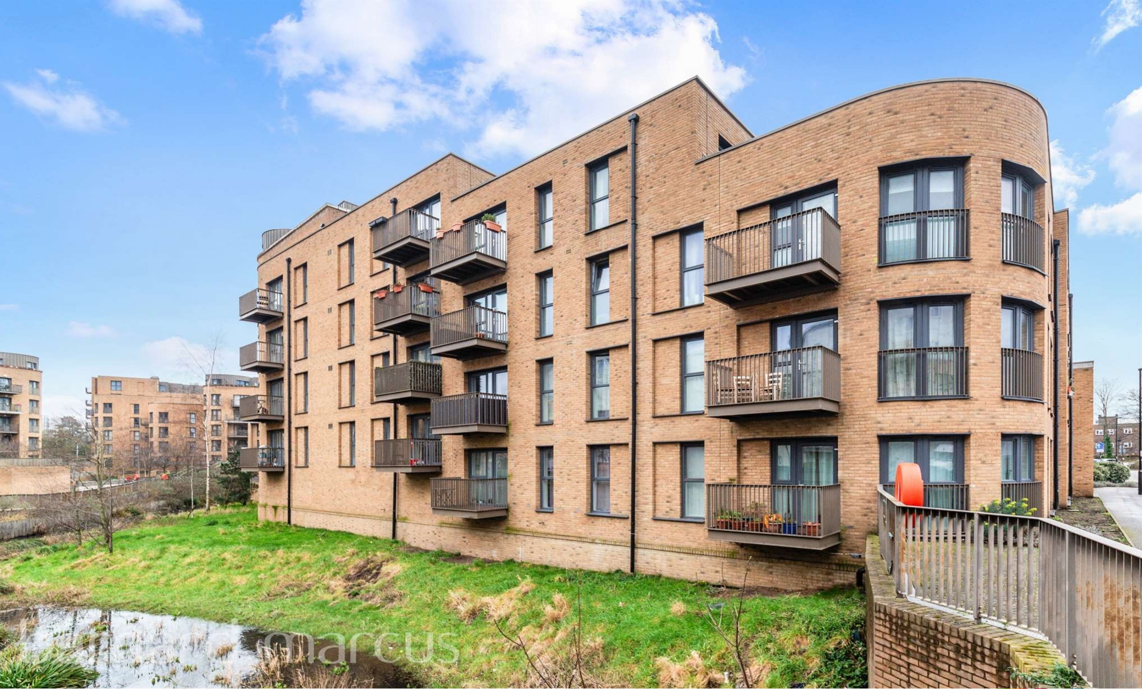
Palladian Court Cabot Close, Croydon CR0 4FP