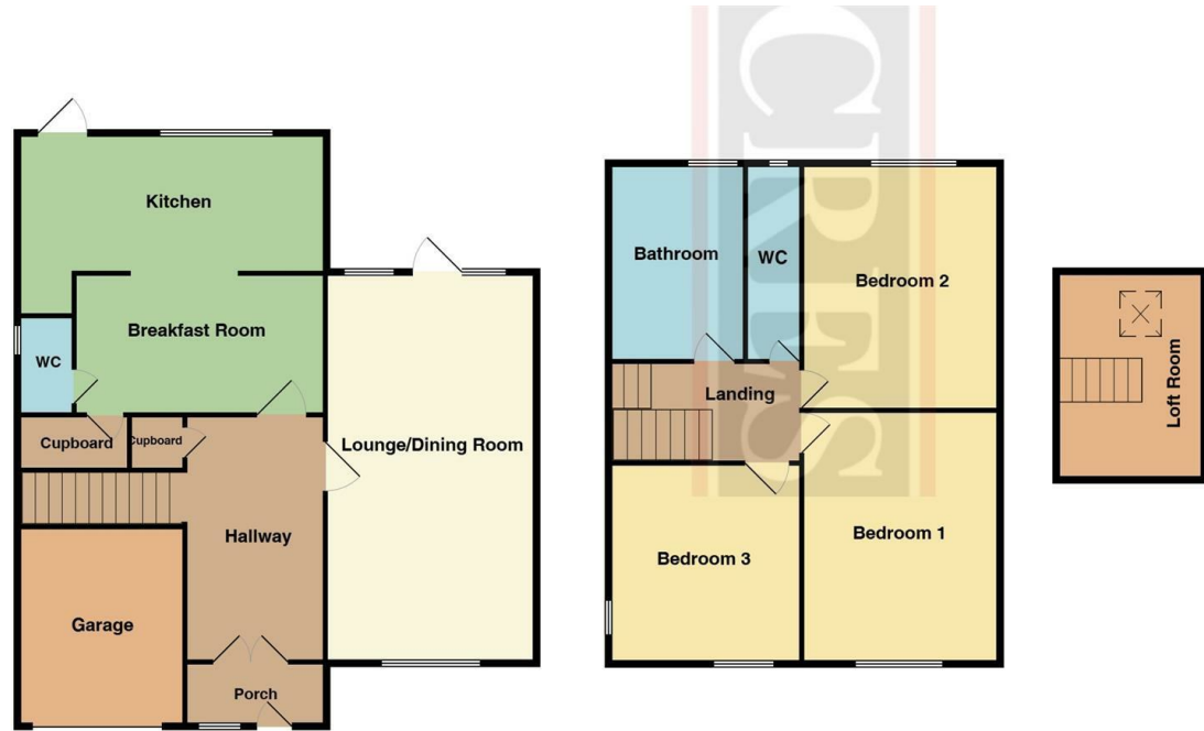
THIS PLAN IS NOT TO SCALE AND IS GIVEN TO PROVIDE A GENERAL GUIDE. IT MERELY INDICATES APPROXIMATE RELATIONSHIP OF ONE ROOM TO ANOTHER.

Every care has been taken with the preparation of these Particulars but complete accuracy cannot be guaranteed. If there is any point, which is of particular importance to you, please obtain professional confirmation; alternatively, we will be pleased to check the information for you. We have not tested any apparatus, equipment, fixture, fittings or service and so cannot verify they are in working order, fit for their purpose, or within ownership of the sellers. All Dimensions are approximate. Items shown in photographs are NOT included unless specifically mentioned in writing within the sales particulars. They may however be available by separate negotiation.