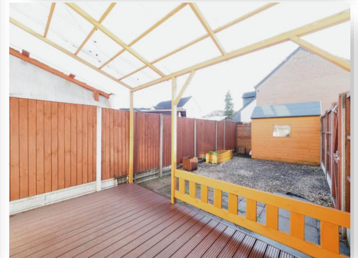
Cabin Leas, Loughborough