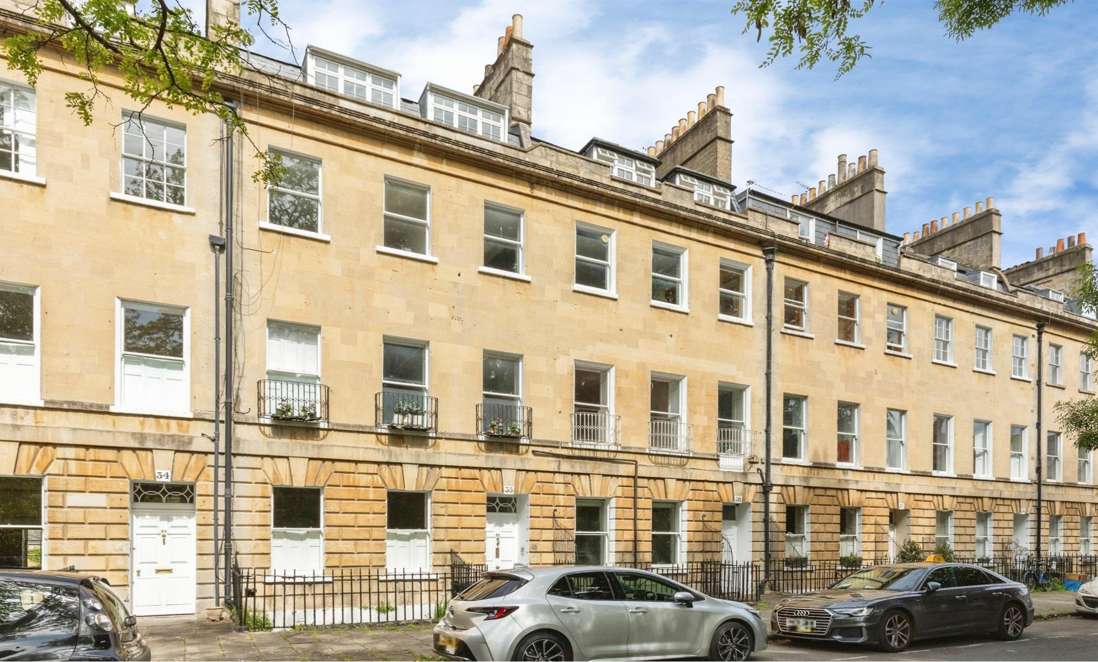
Green Park, Bath BA1 1HZ