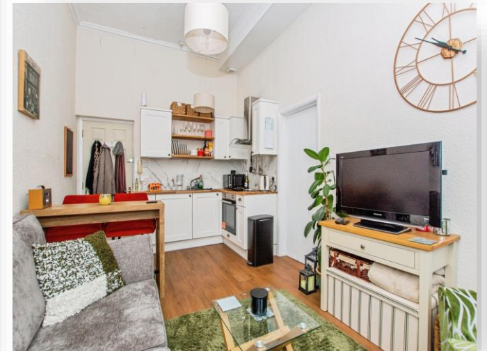
Turnpike Court, Norwich Road, Wisbech, PE13 3LX