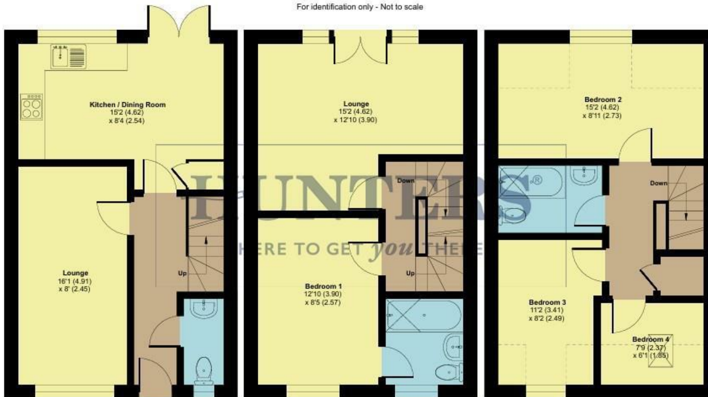
GROUND FLOOR APPROX FLOOR AREA 35.3 SQ M ( 381 SQ FT)