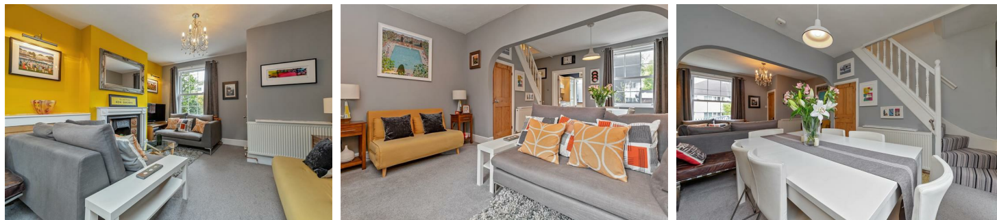
Ground Floor Approx. 480.6 sq. feet

Conveniently located, this property is just a short distance from Abbey Station, making commuting a breeze. Additionally, Sainsbury's and other local stores are within easy reach as well as Verulam Park, ensuring that all your daily needs are met. With quick access to the city centre, this home is perfectly positioned for those who appreciate both tranquillity and convenience. This charming cottage is a rare find in a sought-after area, offering a wonderful opportunity for anyone looking to settle in St. Albans.