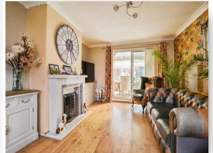
Bransdale Road, Middlesbrough TS3 7QQ