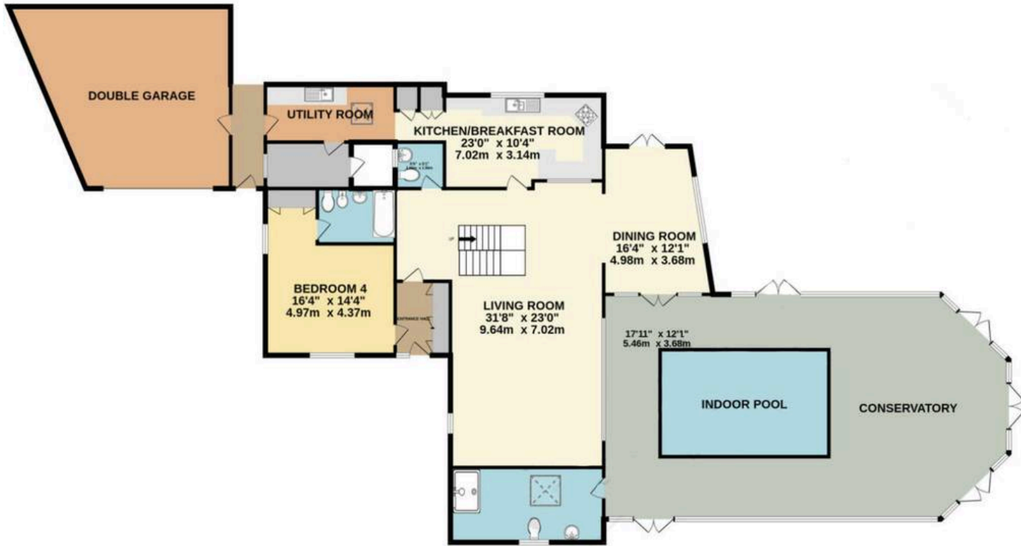
GROUND FLOOR 3103 sq.ft. (288.3 sq.m.) approx.