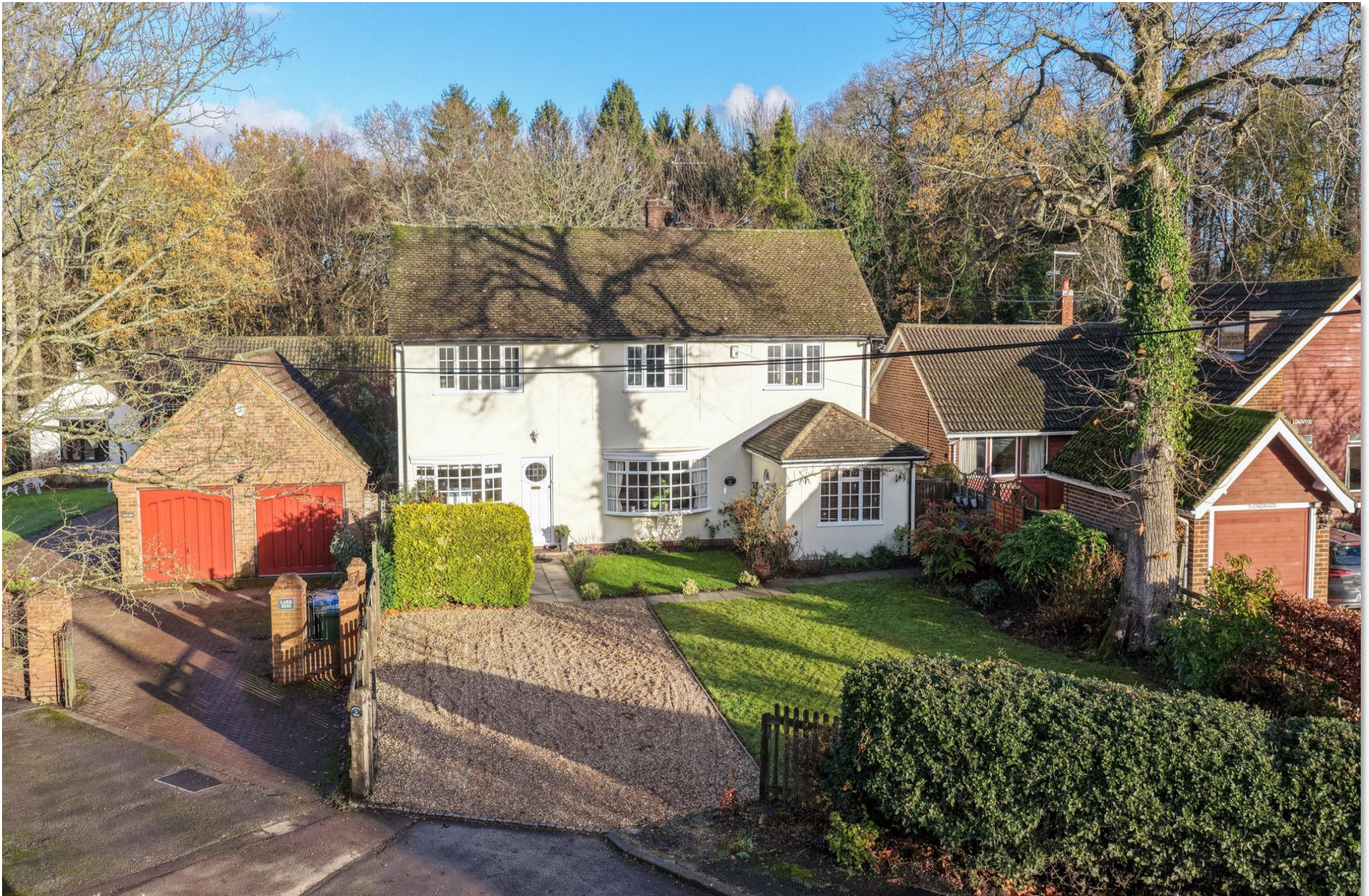
Chestnut House Hollybush Close, Potten End Berkhamsted HP4 2SN