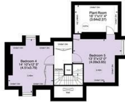
Second Floor - Approx 44 Sq m - 474 Sq ft

Drive Approximately 17' 0" x 8' 10" (5.18 x 2.70)