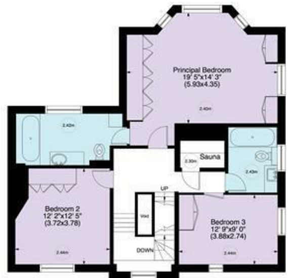
First Floor - Approx 82 Sq m - 887 Sq ft