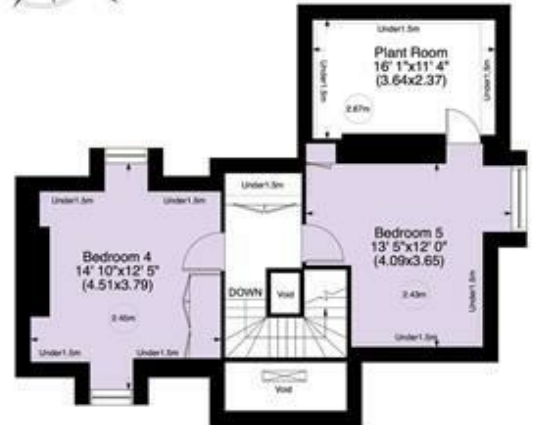
Second Floor - Approx 44 Sq m - 474 Sq ft