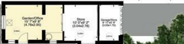
Ground Floor - Approx 29 Sq m - 313 Sq ft

Drive Approximately 17' 0" x 8' 10" (5.18 x 2.70)