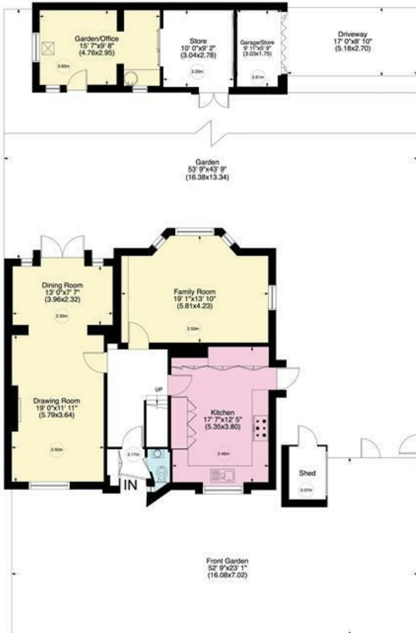
Ground Floor - Approx 92 Sq m - 991 Sq ft