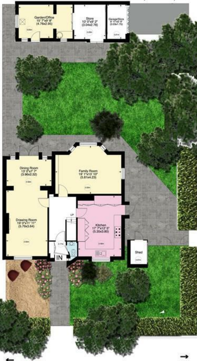
Ground Floor - Approx 92 Sq m - 991 Sq ft