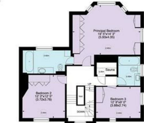
First Floor - Approx 82 Sq m - 887 Sq ft