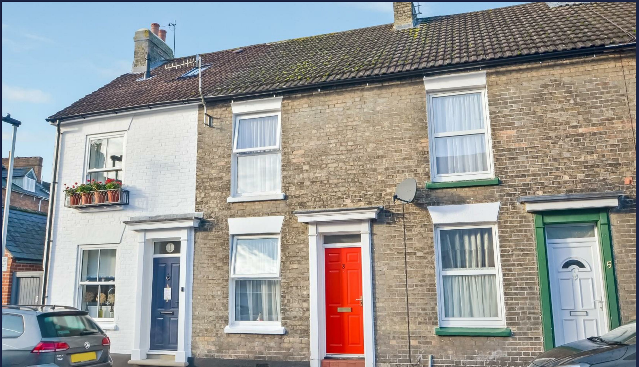
South Street, Salisbury