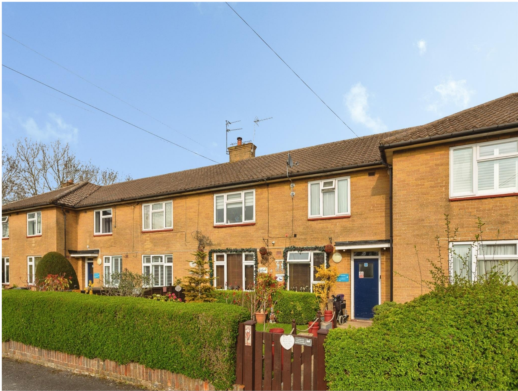
Linton Avenue, Borehamwood, WD6 4QZ