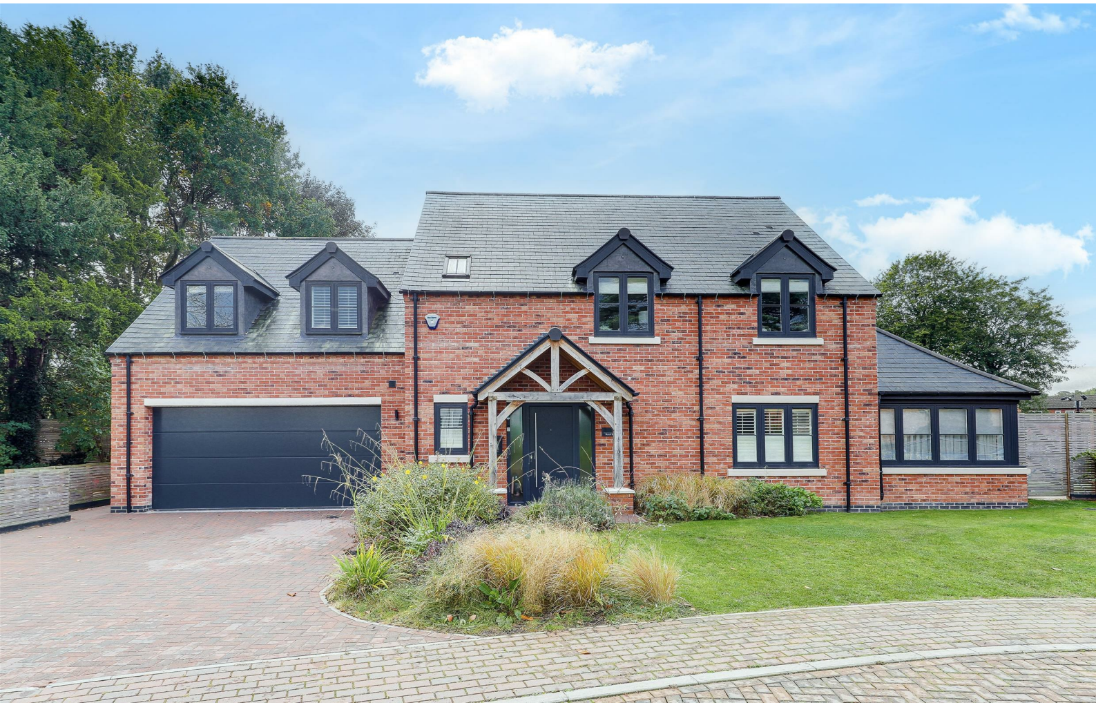
Rectory Mews, Clifton Village, Nottinghamshire NG11 8EU