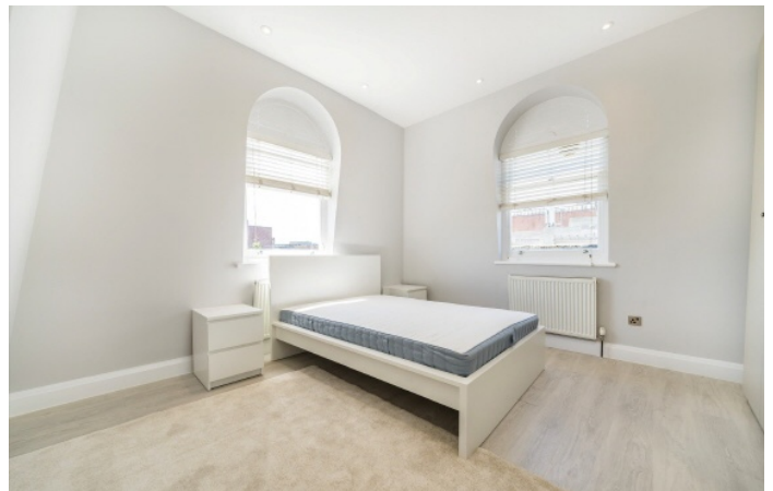
Lewisham High Street, SE13