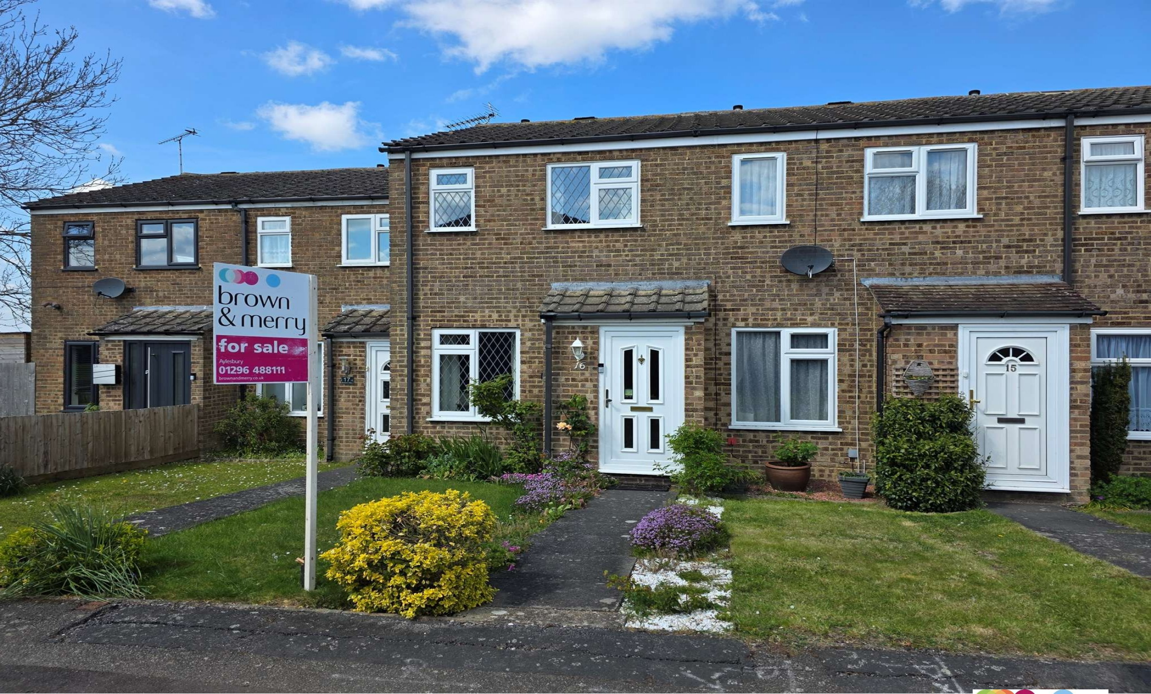
Redland Way, Aylesbury HP21 9RJ