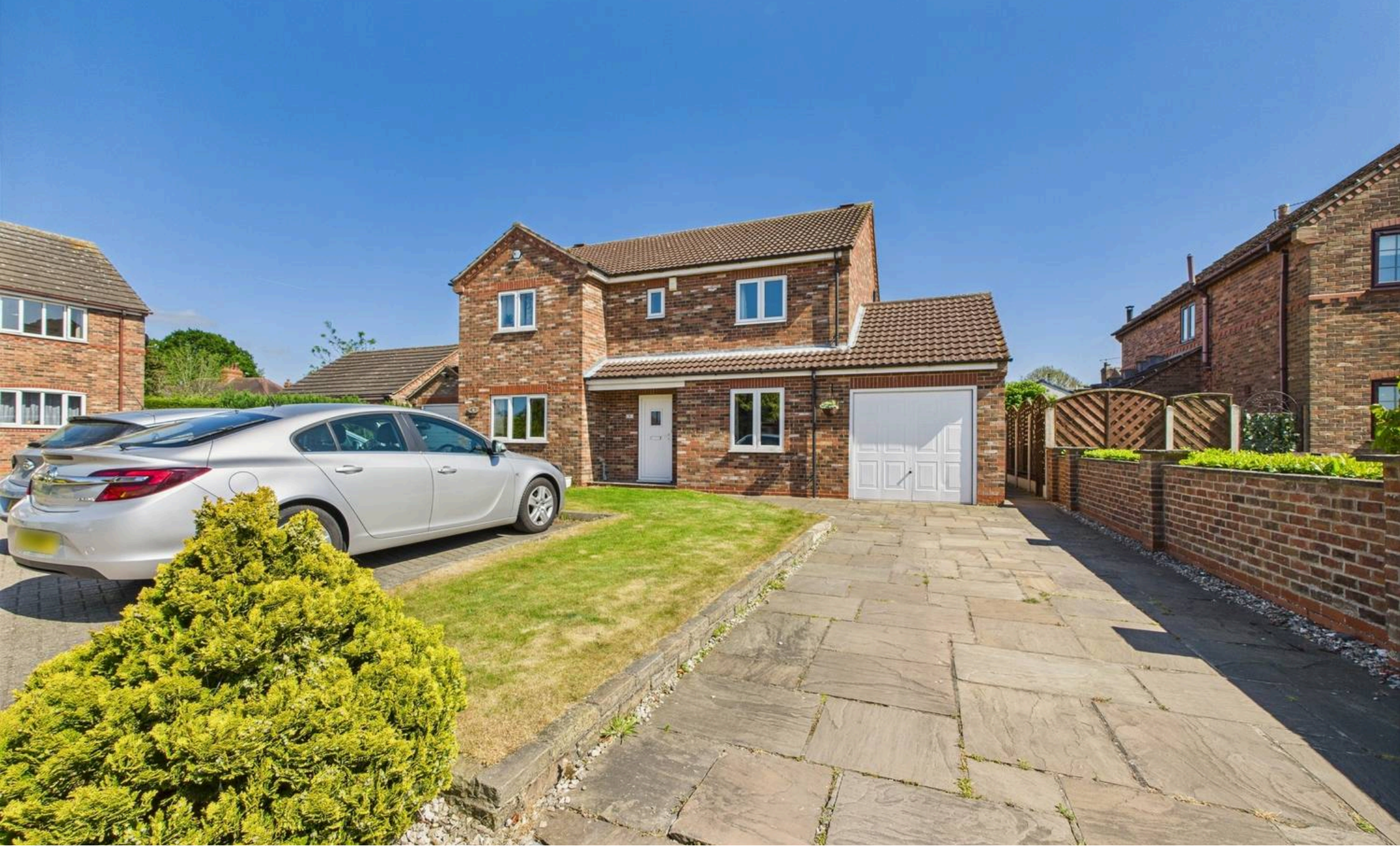
4 Scardale Court, Brayton £285,000