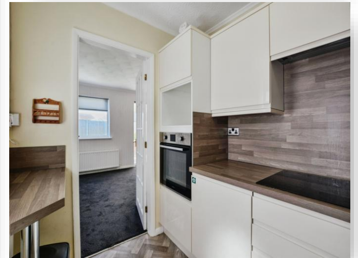
Biscay Close, Skegness PE25 1JR