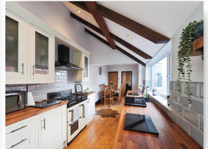
Leicester Road, Shepshed