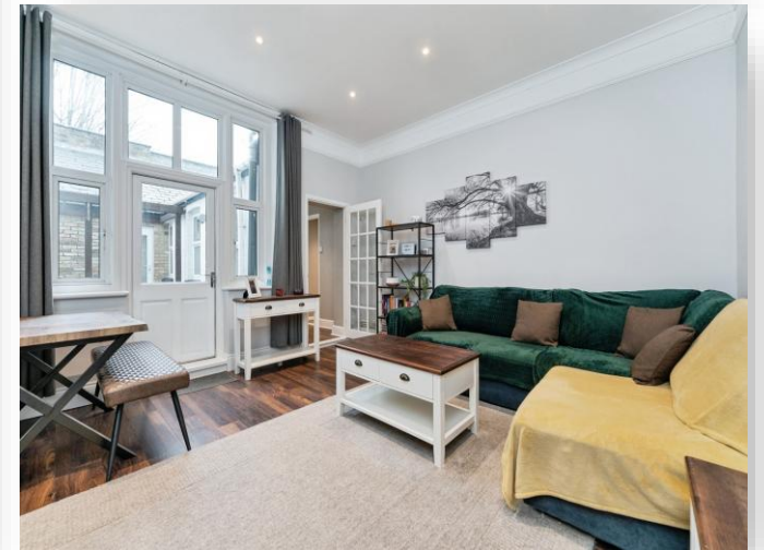
Main Street, Littleport CB6 1PH