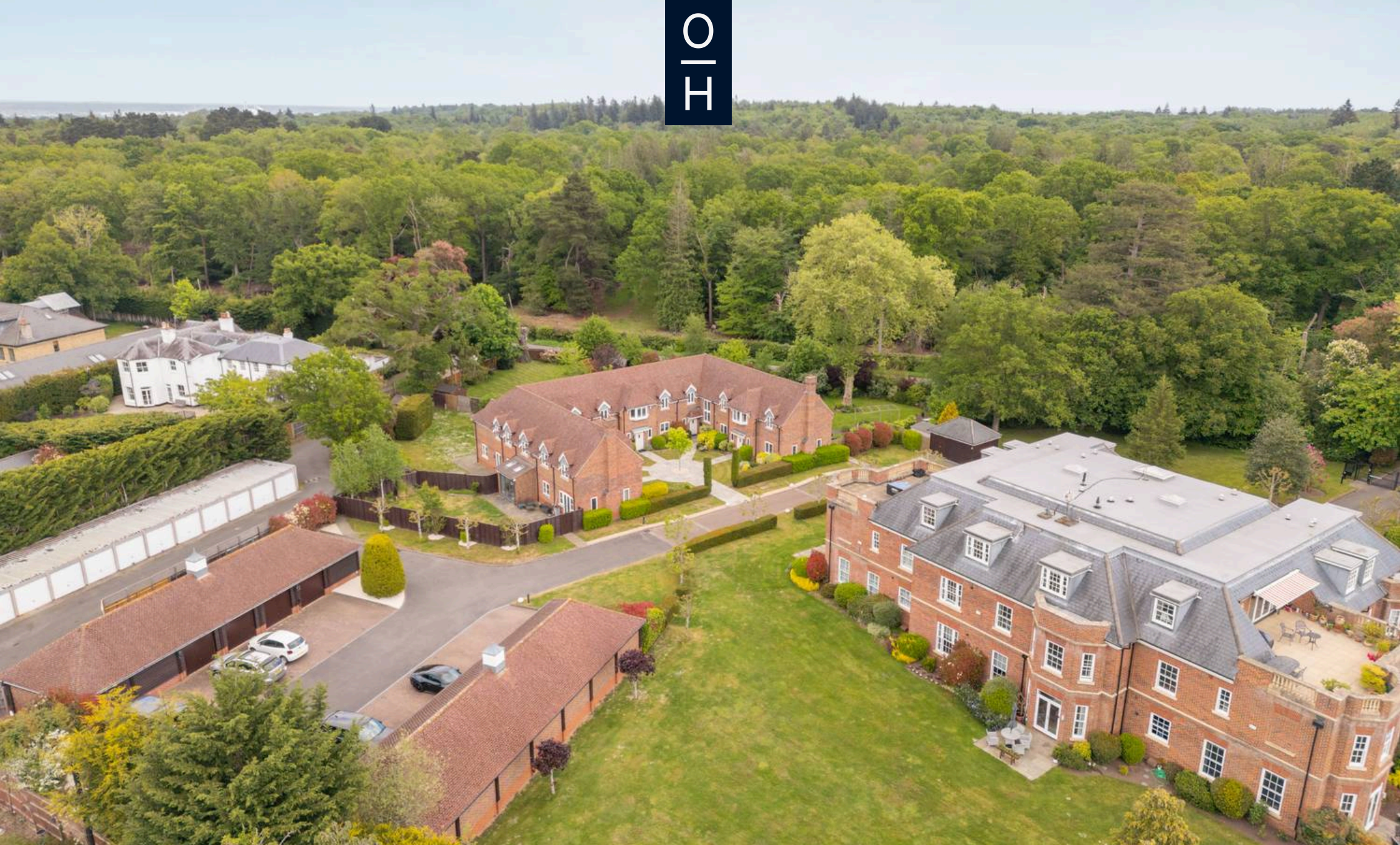
Cranbourne Hall, Winkfield £885,000