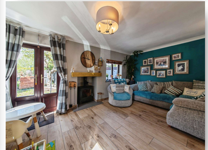
High Street, Walcott Lincoln LN4 3SW