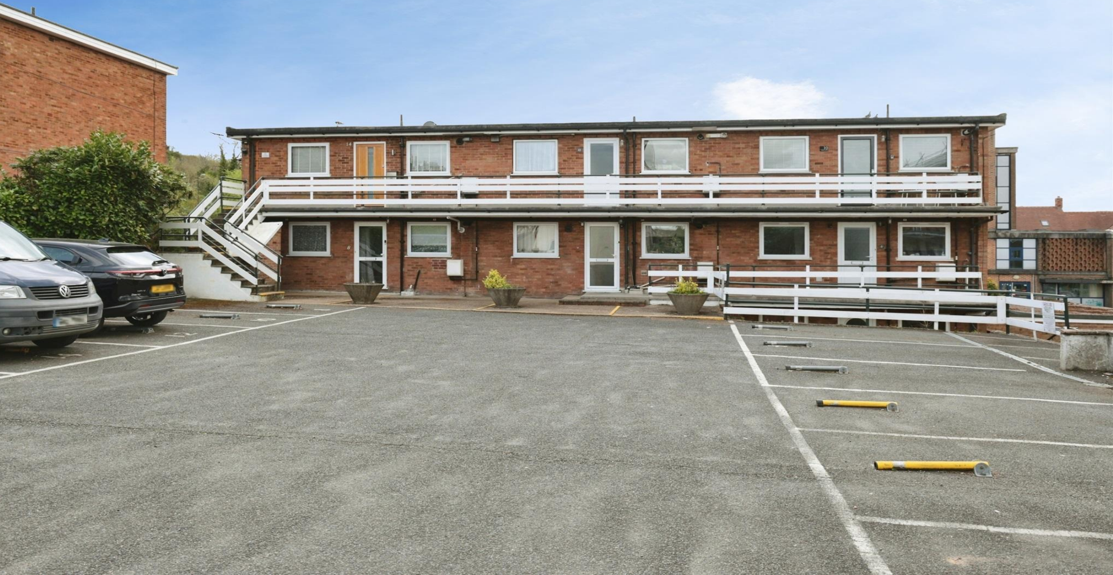
Gladstone Court White Hill, Chesham HP5 3AA