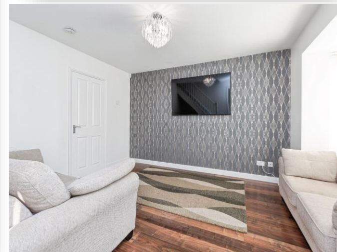
Bonington Crescent, Billingham TS23 3WJ