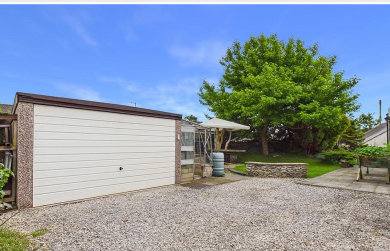
Driveway / Garage

roundabout onto the A590 and the first exit onto the A6). At the next junction (in front of Levens Hall) turn right and follow the signs to Levens, passing under the A590 fly-over road and up the hill into Levens village. Continue along the road until the village shop, turning right onto Main Street, the turn to Orchard Lodge is the first right.