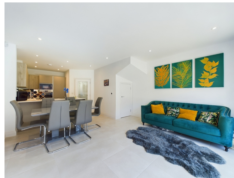
Asking Price | £600,000