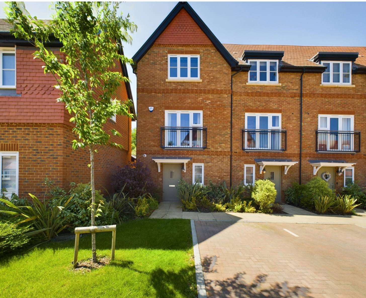
19 Aspen Road, High Wycombe, HP10 9FA