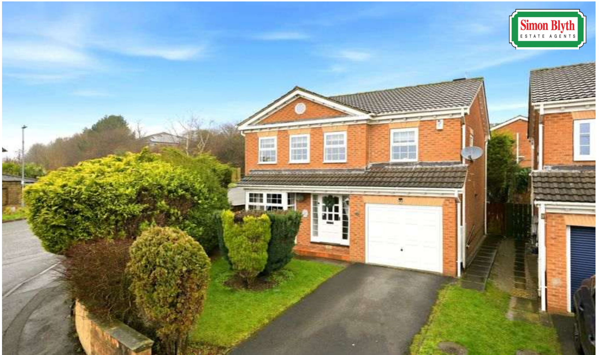
1 Brier Hill View, Bradley, Huddersfield, HD2 1JQ