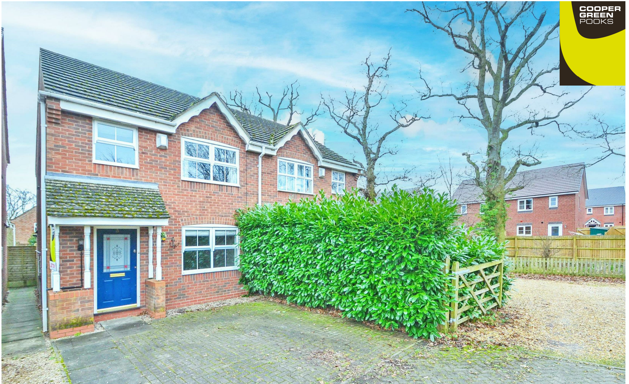
5, Leasows Park, Shawbury, SY4 4UU £900 Per Month