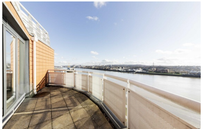
Wards Wharf Approach, E16