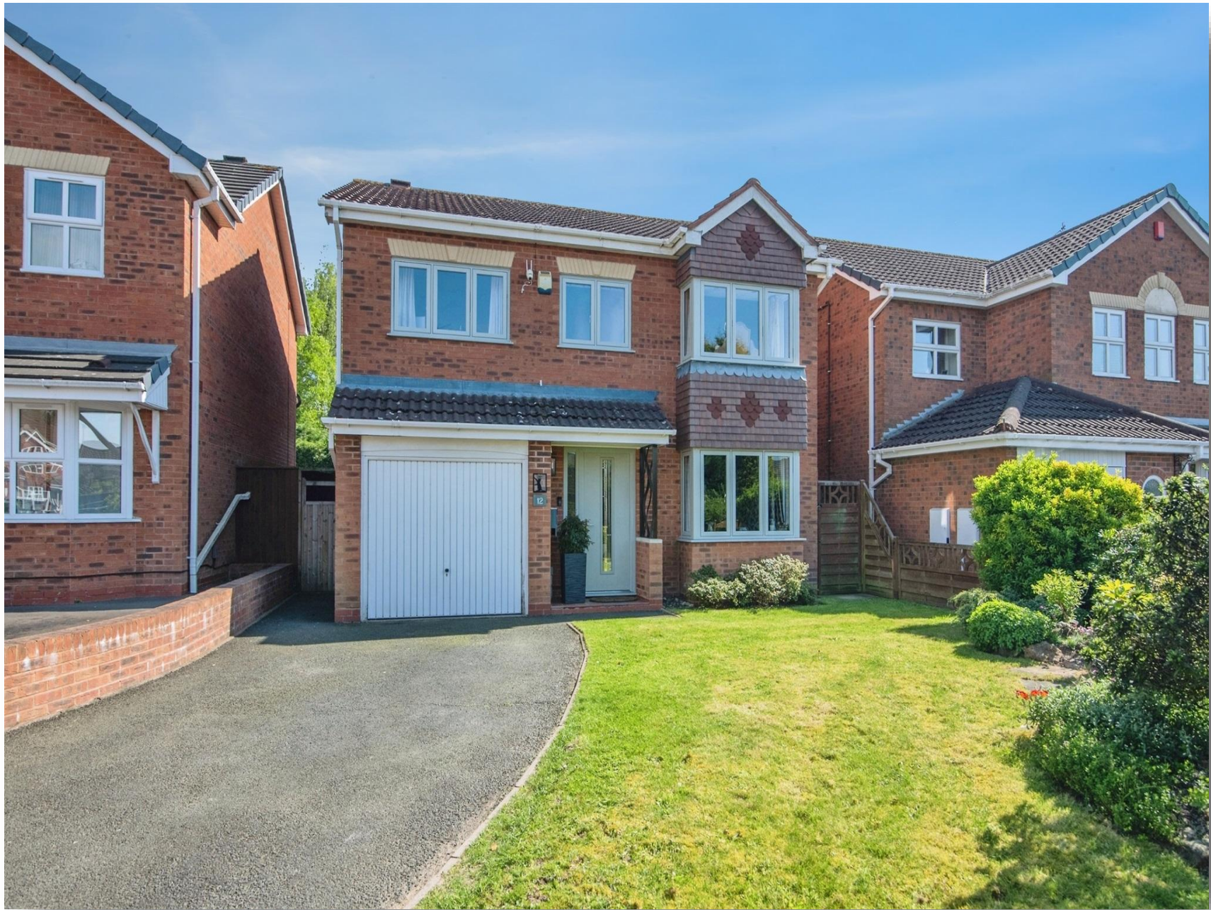
Boscobel Close, DUDLEY DY1 2GA