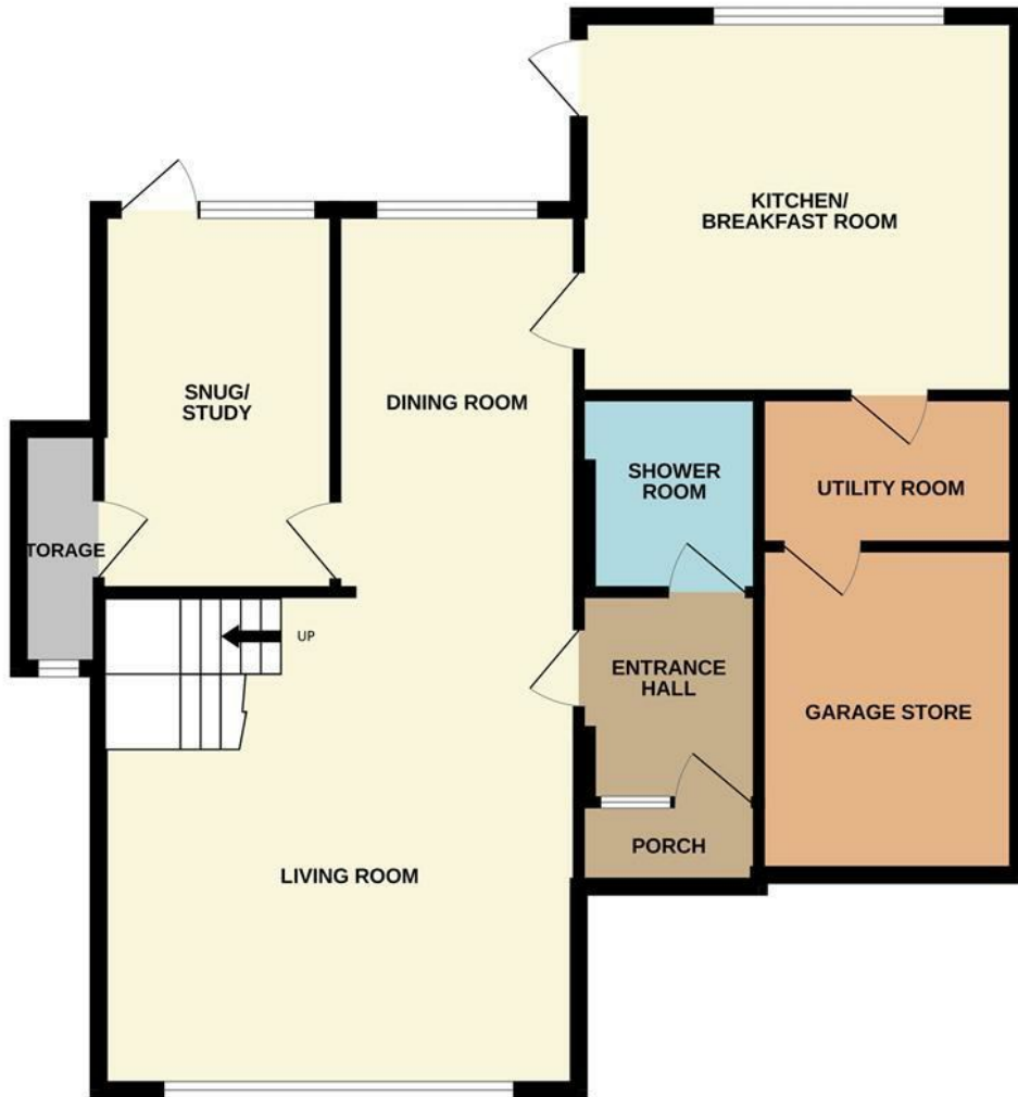
GROUND FLOOR 887 sq.ft. (82.4 sq.m.) approx.