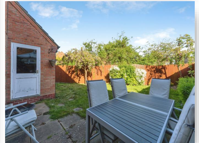
Greenwood Way, Wimblington PE15 0NY