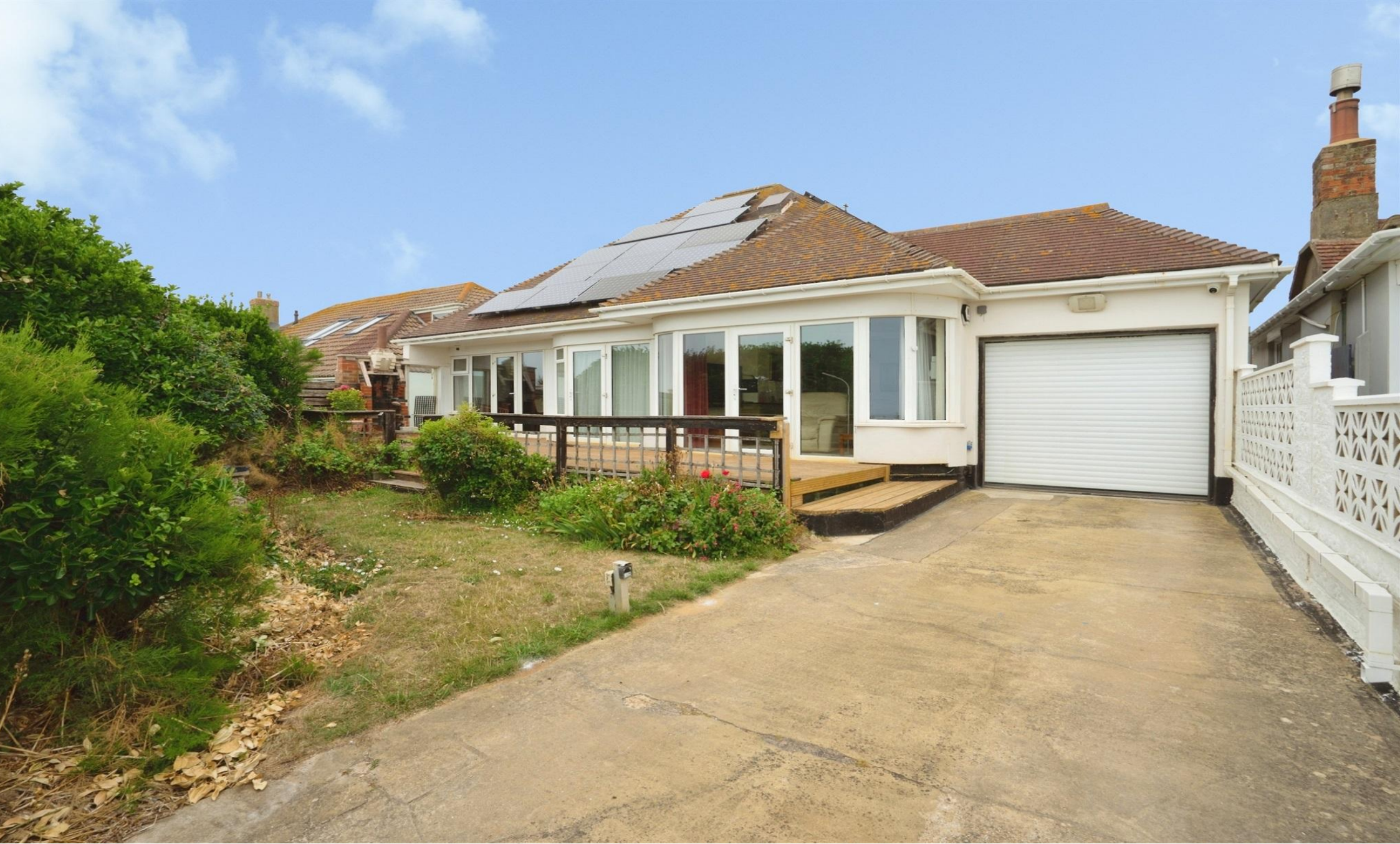
The Esplanade, Telscombe Cliffs Peacehaven BN10 7EY