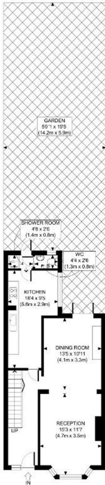
GROUND FLOOR GROSS INTERNAL FLOOR AREA 613 SQ FT