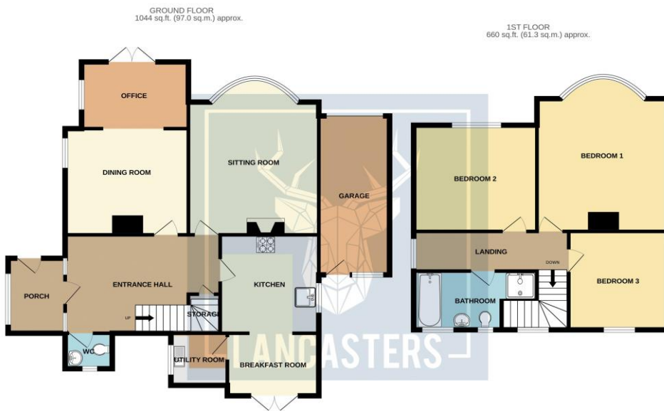
GROUND FLOOR 1044 sq.ft. (97.0 sq.m.) approx.