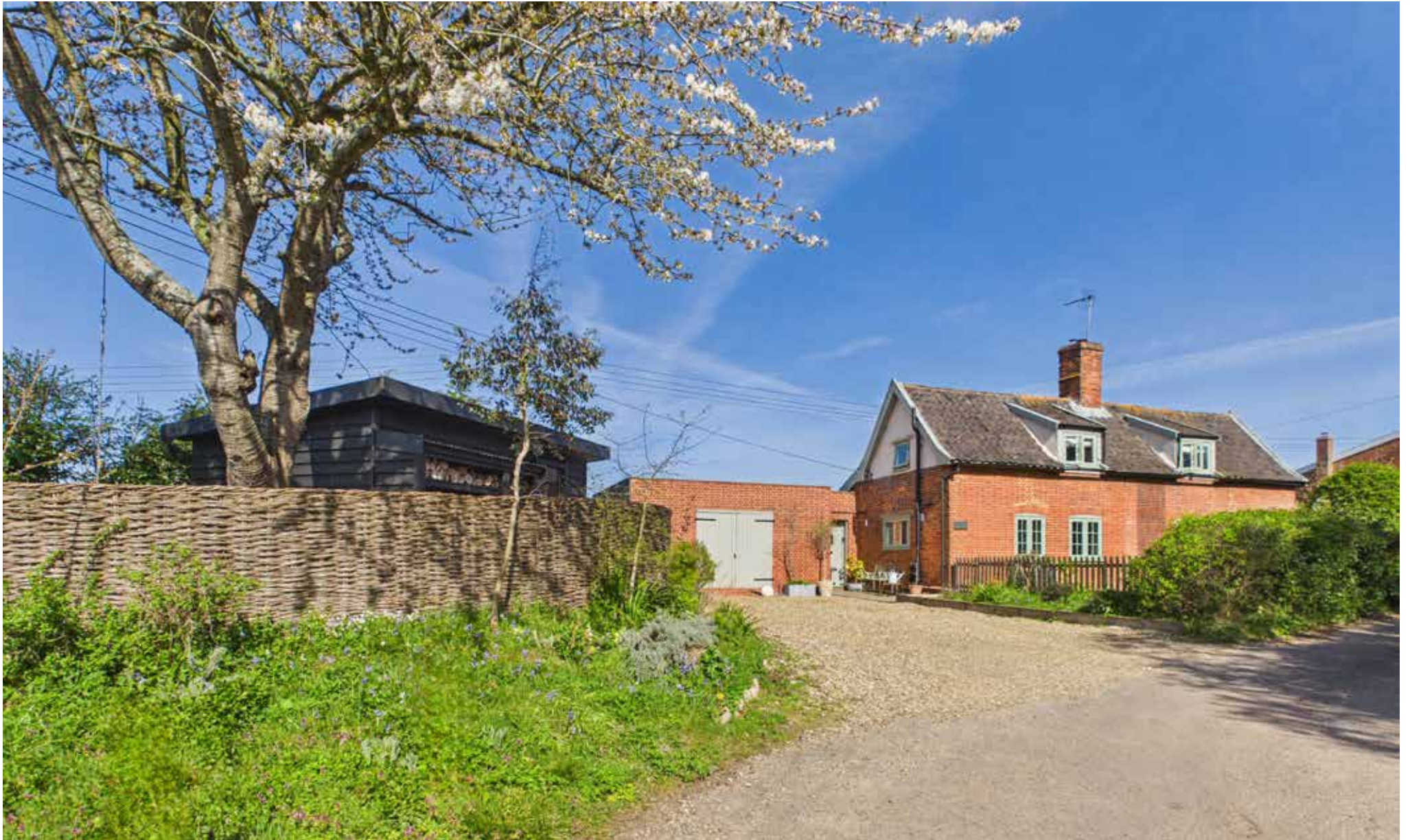
Hill House Brussels Green | Darsham | Suffolk | IP17 3RN